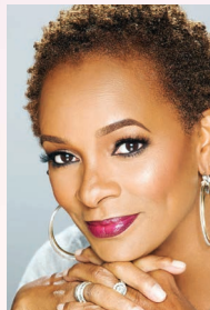
Vanessa Bell Calloway